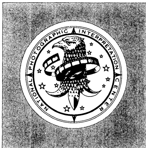
NATIONAL PHOTOGRAPHIC INTERPRETATION CENTER