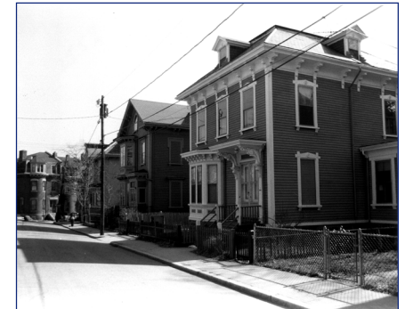
Sumner Hill Historic District, Jamaica Plain: a National Register Historic District