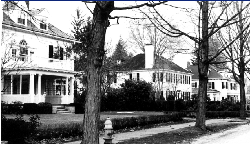
Massachusetts Avenue Historic District, Worcester, both a Local and National Register Historic District

Can a property be designated both as part of a National Register District and as a part of a Local Historic District?