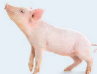
Piglet page 6

Online ELCA.org/goodgifts Phone 800-638-3522 Mail Send the enclosed order form to: Evangelical Lutheran Church in America P.O. Box 1809 Merrifield, VA 22116-8009