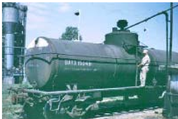
(6) Soybean oil from OVSC being loaded into a railroad tank car.

189. Soybean Digest . 1953. To build Iowa plant [Boone Valley Cooperative]. Jan. p. 21.