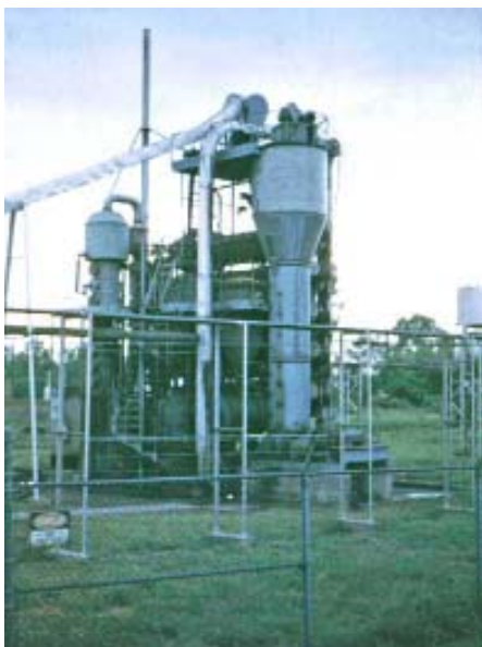
(1) The hexane solvent extraction plant in about 1952 (perhaps 1951).