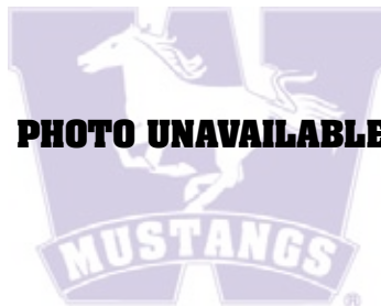
NAME: Trevor Nicholas HOMETOWN: Brampton, Ont. PROGRAM: Sciences EVENTS: 100m Back/200m IM