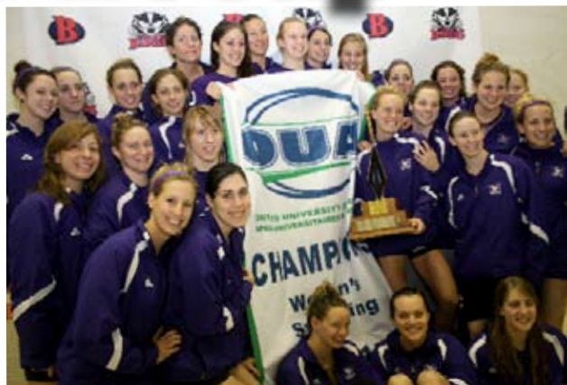
Western Mustangs, women's OUA champions

Western's women won all five relays at the OUA championships, setting OUA records in four of the races and missing a fifth record - one that Western holds - by just 0.3 seconds.