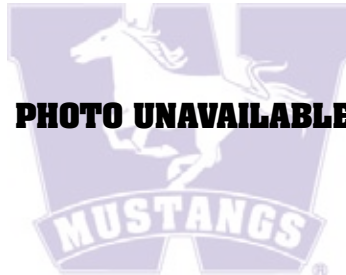
NAME: James McClelland HOMETOWN: Markham, Ont. PROGRAM: IMS EVENTS: 100/200m Back