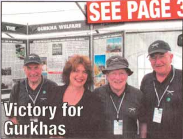
Victory for Gurkhas