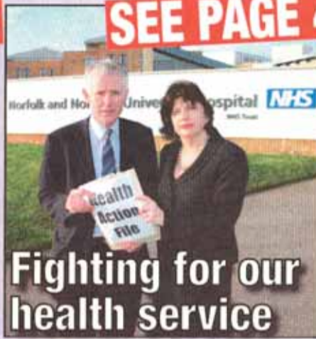
Fighting for our health service